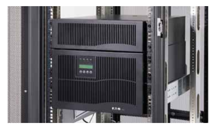
The 9140 and one EBM occupy only 9U of rack space.