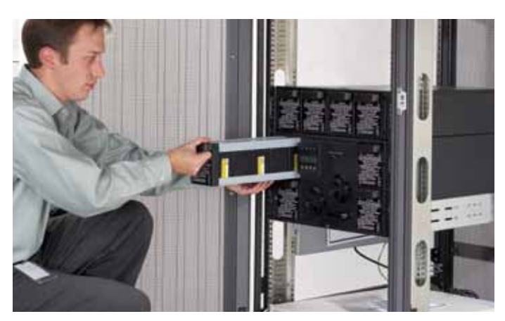
Modular, lightweight design allows for easy installation and service.

Standard internal batteries provide ride-through power until auxiliary power takes over or systems are gracefully shut down. Eaton's unique ABM battery charging technology significantly extends battery service life while optimizing the battery recharge time and giving you up to 50 percent more battery life. For greater runtime, you can add up to four extended battery modules (EBMs). Depending on your load, this could give you hours of runtime.